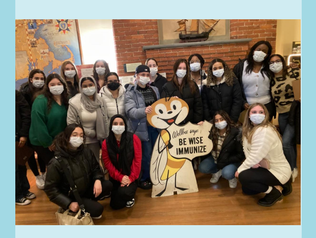
Medford Tech's students visited the museum in December.

The museum is seeking indoor and outdoor volunteer guides. Training is available. The museum is open Thursdays and Saturdays at this time. <a href="mailto:info@publichealthmuseum.org">info@publichealthmuseum.org</a>